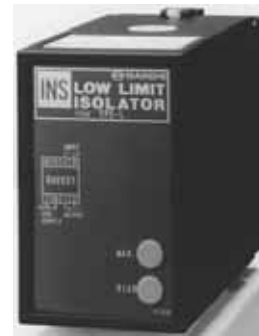
TP2-C7F5L (80 × 50 × 123mm/300g)